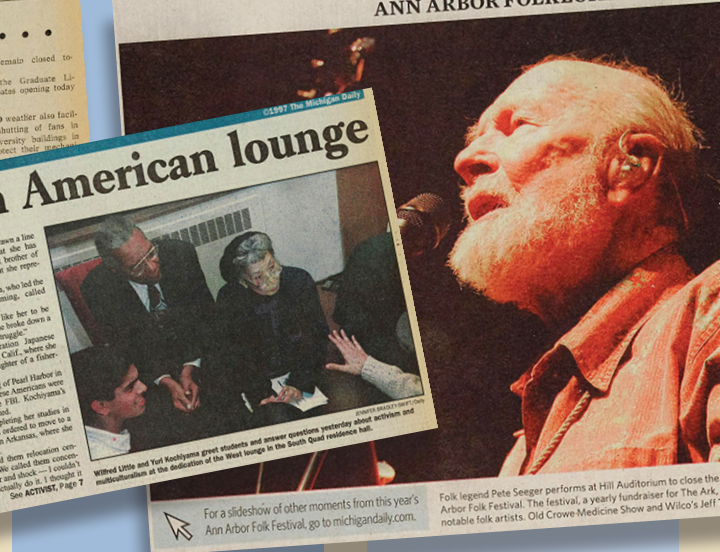
THE MICHIGAN DAILY