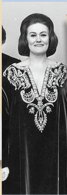
UNIVERSITY MUSICAL SOCIETY